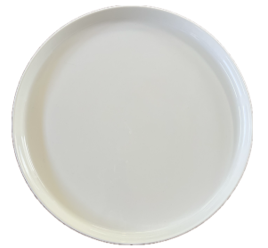
Large White 14" Round $7