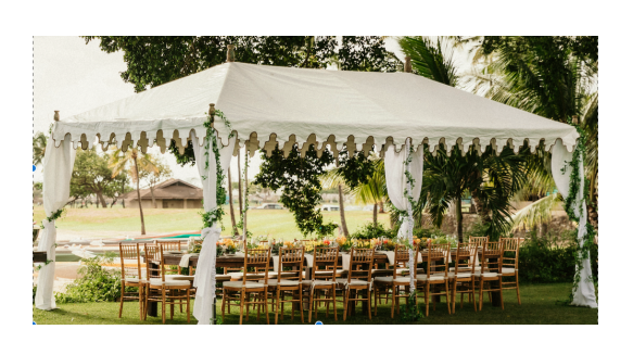
White Tent 10ft x 20ft $500