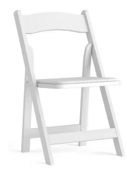
Folding Chair White $15