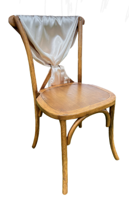
Crossback Chair Natural Brown $15