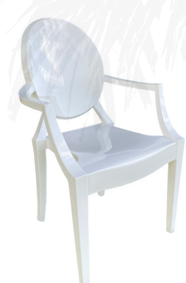
Acrylic Chair White $15