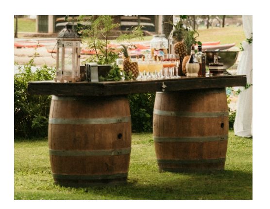
Rustic Bar Table Dark Brown $85