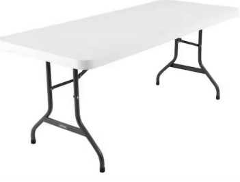
6ft Rectangle Table Seats 6-8 pax (L6ft W2.5ft H2.5ft) $18