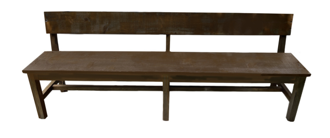
Benches (Seats 3-4 pax) Dark Brown $15