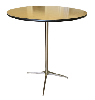
36 inch Round cocktail table Adjustable height: 30" or 42" $20