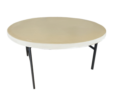
60 inch round table Seats 8 pax $18